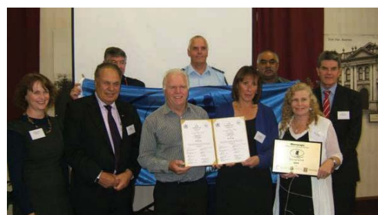
Members of Coalition Hub at the Designation ceremony ⇨