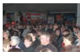
Scenes from the accreditation event

Woodend School has had a remarkable turnaround from 2001 when the school embarked on its safety upgrade - after serious concerns were raised about the emotional and physical well being of its students. There were problems with children at risk crossing the Main North Road, being bullied by others, or in danger of being injured by unsafe playground equipment or behaviour.