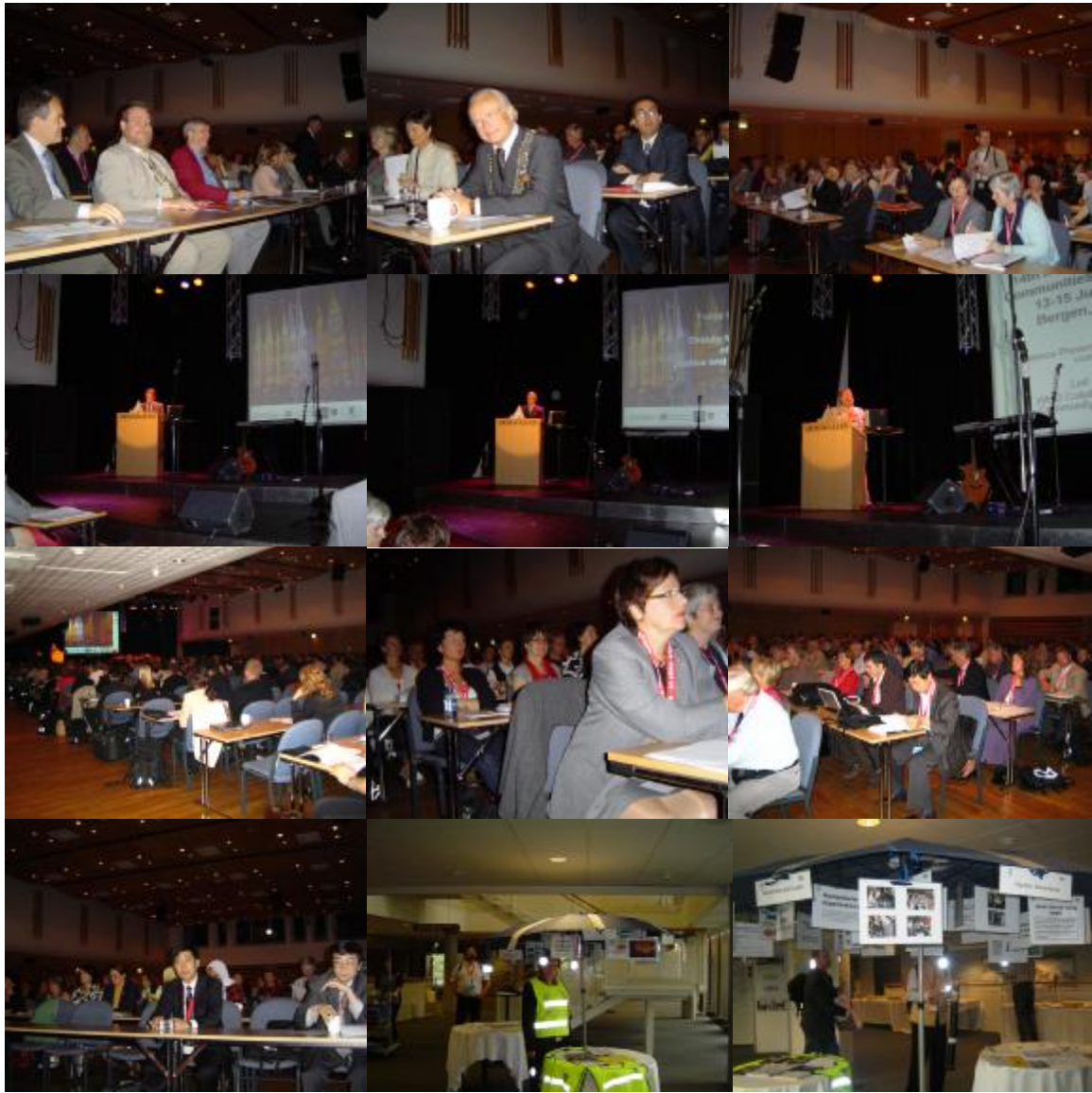
Preparations for the conference