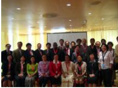
International Safe Community Weekly News team