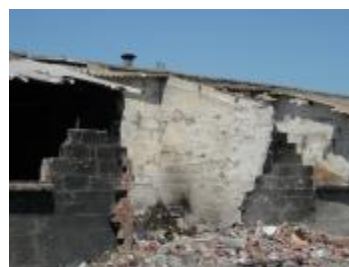
Burnt out home