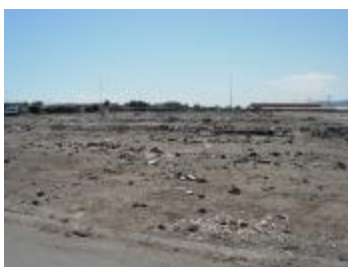
What is left after taking the rubble away- area for reconstruction of four storey houses