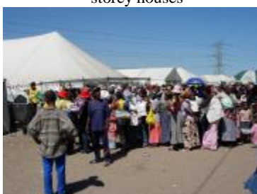
Waiting line for food in temporary tent community