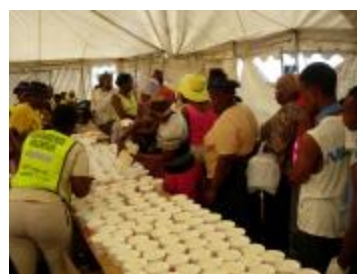
Sour milk as bulk food