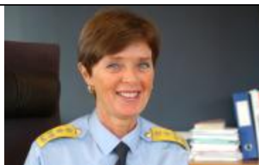
Ingelin Killengreen, National Police Commissioner, Norway

After introducing the Safety Policy concept of 'Safe Communities' in the 1970's he leads a team concentrating in developing process and outcome evaluation of intervention programmes. Through system oriented models he has also participated in development of the Stockholm Cancer Prevention and Diabetes type II intervention programmes.